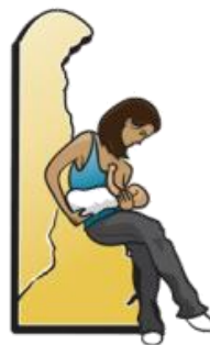
Breastfeeding Coalition of Delaware

The Breastfeeding Coalition of Delaware (BCD) is hosting a "Meet and Greet" on January 29 at 5:00 p.m. at Bayhealth Kent Campus. This event is open to breastfeeding advocates in Delaware. Dinner will be provided. Register at https://tinyurl.com/bcdmag2 .